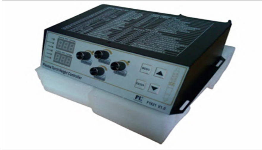
Torch Height Controller