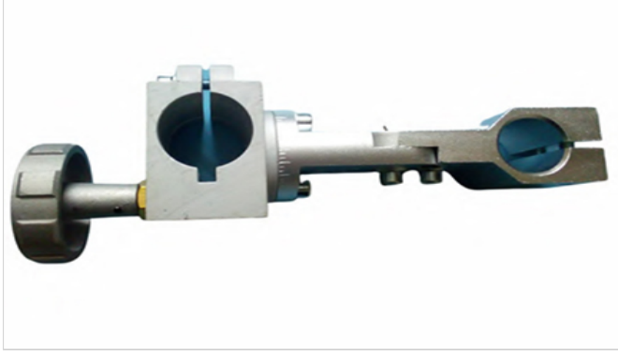
Oxy Fuel Torch Holder